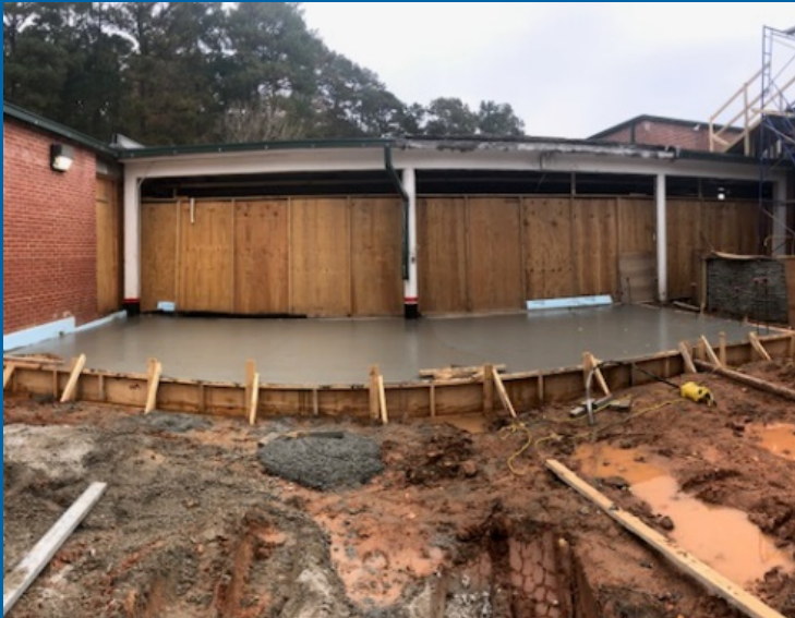
Main Entrance Addition Slab on Grade