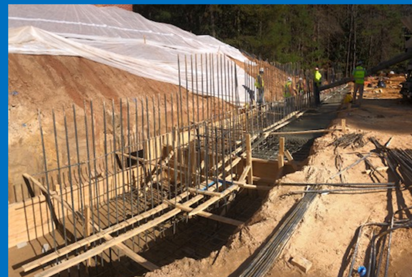
First Concrete Pour at Gymnasium Footings