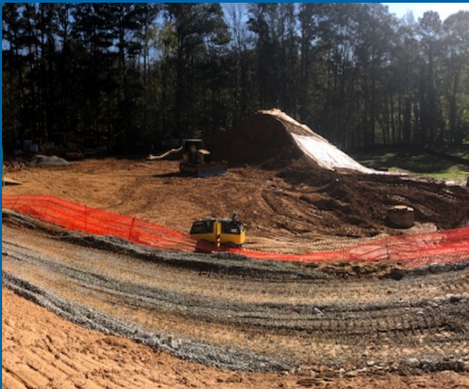
Underground Storm Structure Backfilled