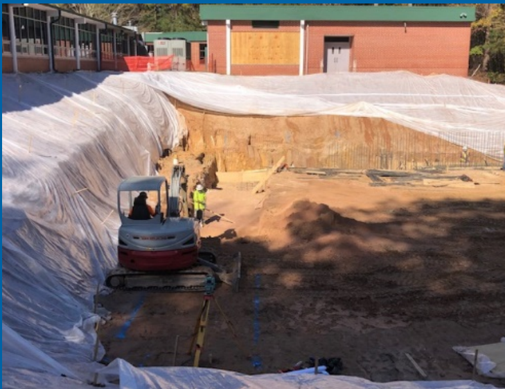
Continuation of Gymnasium Foundations