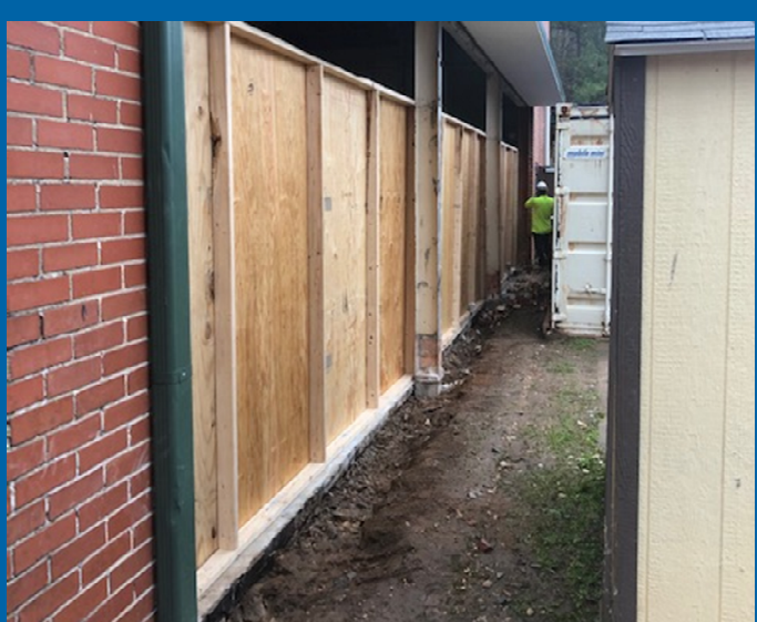
Exterior Wall Demo