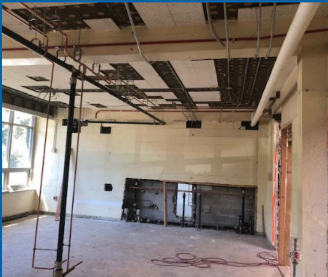
OH Rough at SW Wing