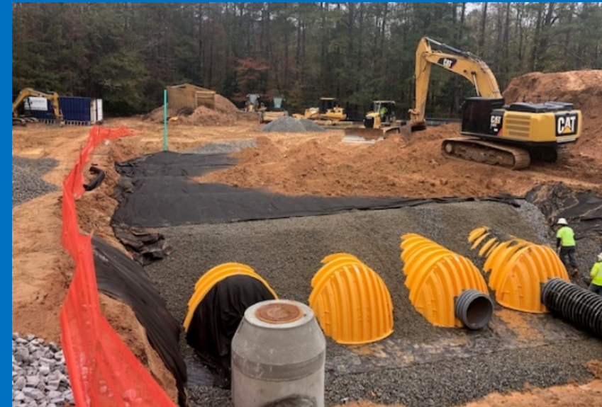
Stormtech Underground Drainage System